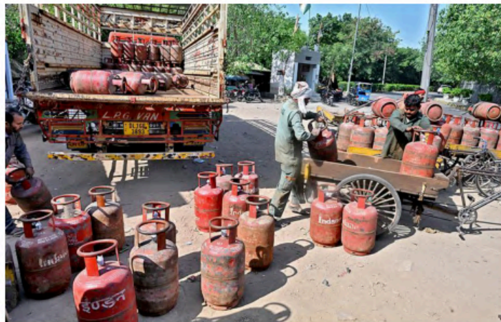
The scene at an LPG depot in New Delhi on Monday. The CM has urged consumers to refrain from stockpiling. SUSHIL KUMAR VERMA

“On the commercial side, Delhi has been allocated 6,480 LPG cylinders (19 kg equivalent) per day. In comparison, the average daily offtake over the past week has been only 4,268 cylinders, including 5 kg