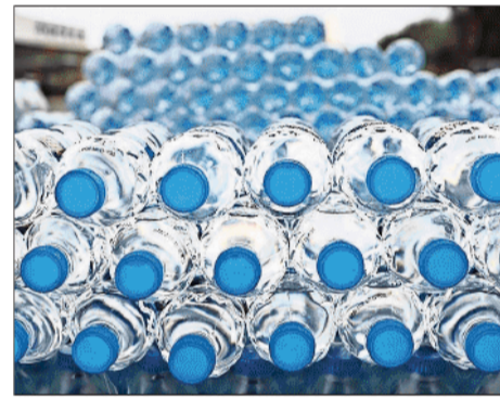
It's a raw materials deal

Companies with strong, established supplier partnerships and long-term