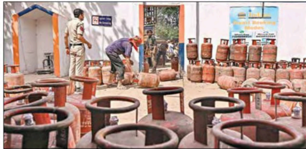
Consumers facing issues in accessing LPG can contact helpline numbers between 9:00 am-7:00 pm

tic LPG distribution, Gupta noted that on April 12, a total of 1,11,766 bookings were recorded, while Oil Marketing Companies delivered 1,30,094 cylinders, significantly exceeding the demand.