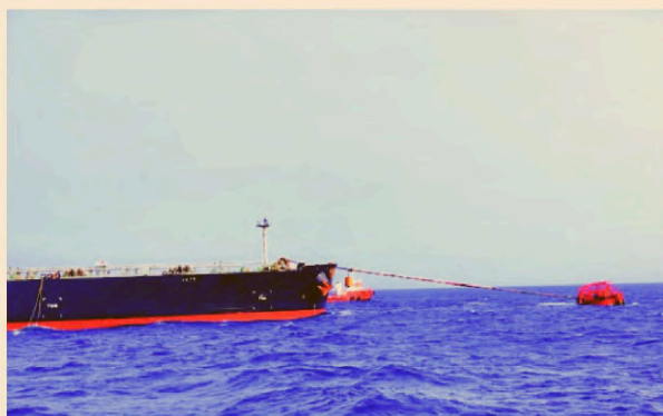
Iranian vessel MT Jaya anchored off Paradip port in Odisha